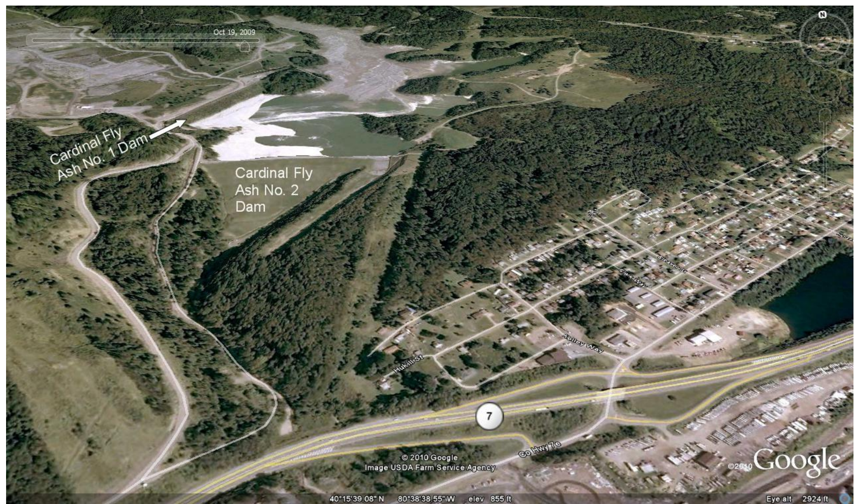
Cardinal Fly Ash Reservoirs : Located in Brilliant, OH, this unlined impoundment is the sixth-largest in the nation.<sup>231</sup> The No. 2 dam reaches a height of 230 feet, with the No. 1 dam rising over 50 feet above it.<sup>232</sup> Ohio does not impose any groundwater monitoring requirements on surface impoundments.<sup>233</sup>