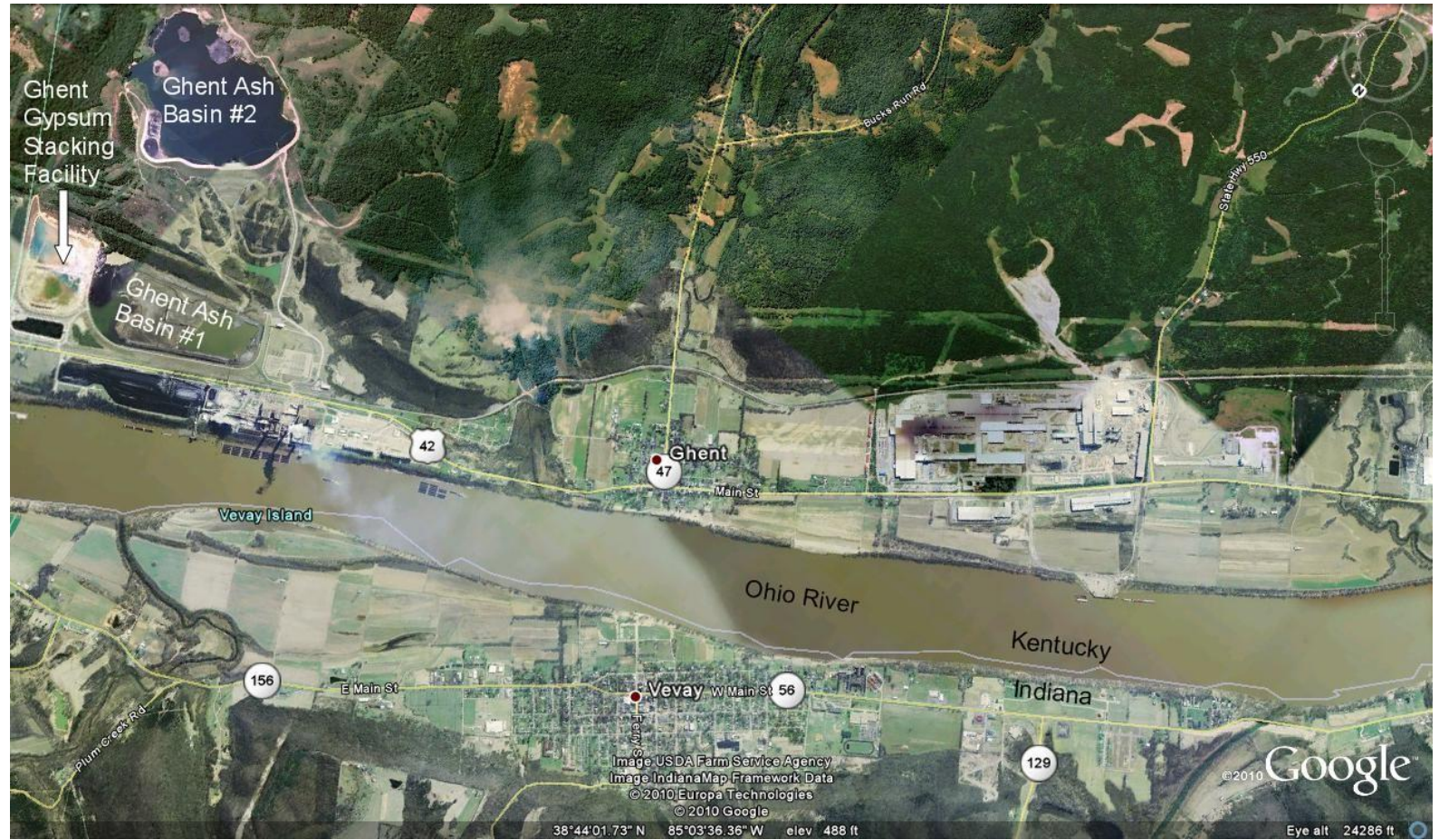
Ghent Ash Basins and Gypsum Stacking Facility : Located in Kentucky, all three of these facilities are rated "high-hazard" by EPA, with ash basin #2 reaching a height of 227 feet.<sup>234</sup> The nearby towns of Ghent, KY and Vevay, IN are only 1-2 miles away,<sup>235</sup> with many schools and churches arranged along the Ohio River.<sup>236</sup> Furthermore, the unlined<sup>237</sup> impoundments contain some of the highest levels of lead, nickel, and thallium in the nation.<sup>238</sup>